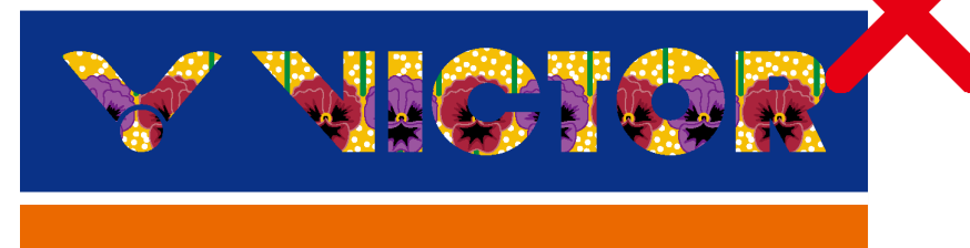
Unsuitable proportion of VICTOR logo