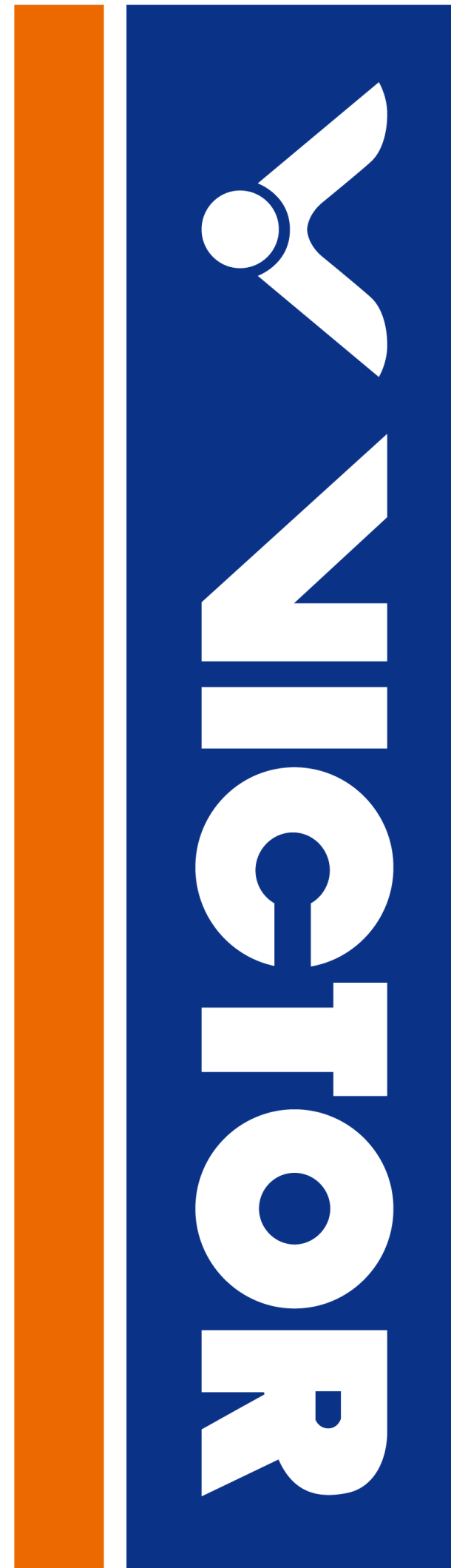
Vertical VICTOR Logo